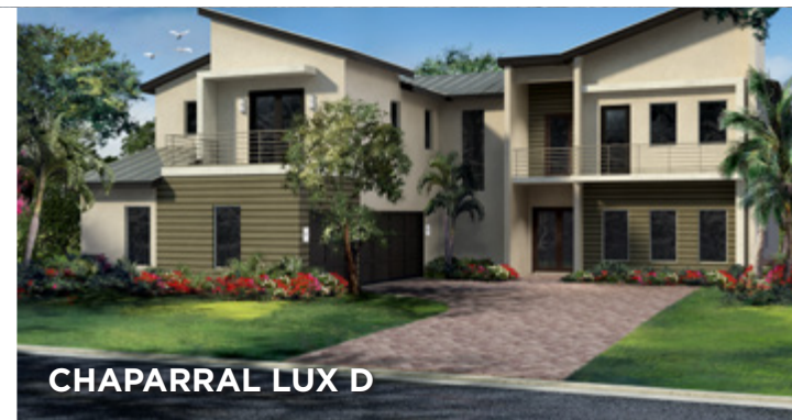
CHAPARRAL LUX D