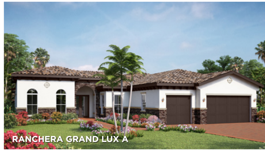
RANCHERA GRAND LUX A