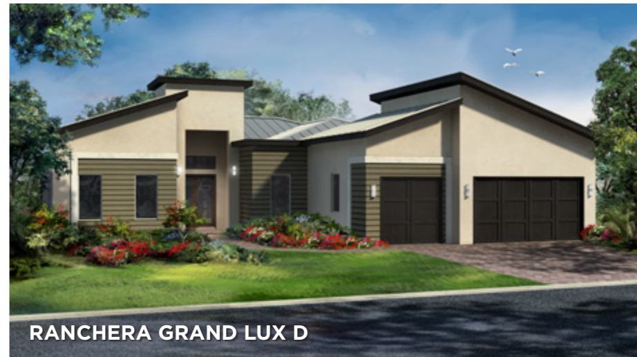
RANCHERA GRAND LUX D