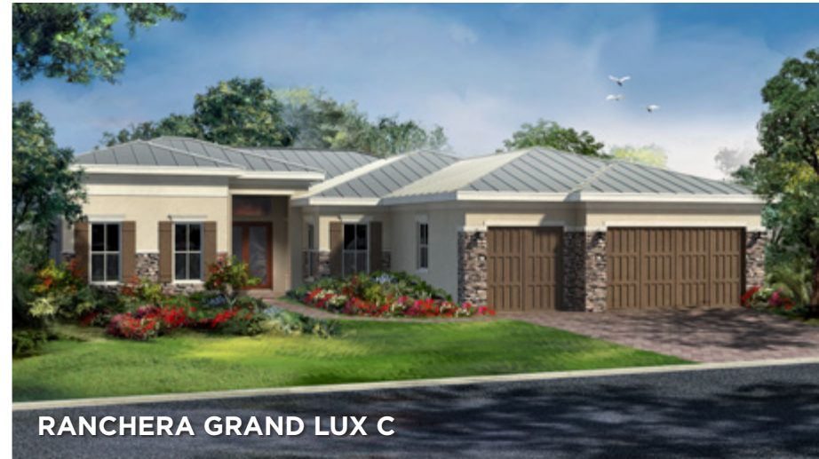
RANCHERA GRAND LUX C