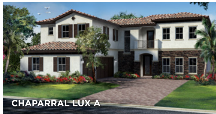
CHAPARRAL LUX A