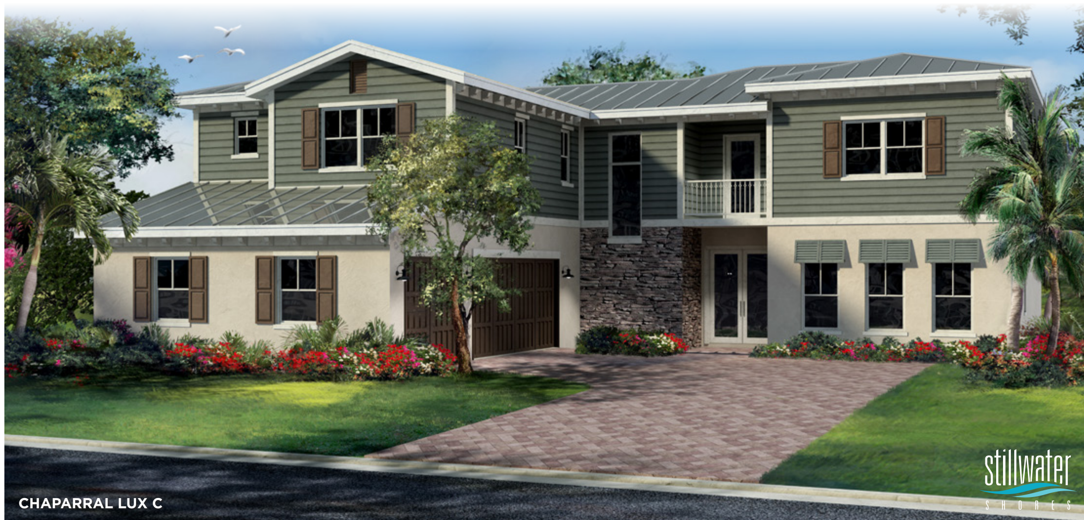
CHAPARRAL LUX C