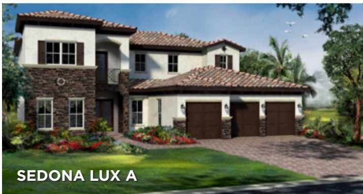
SEDONA LUX A