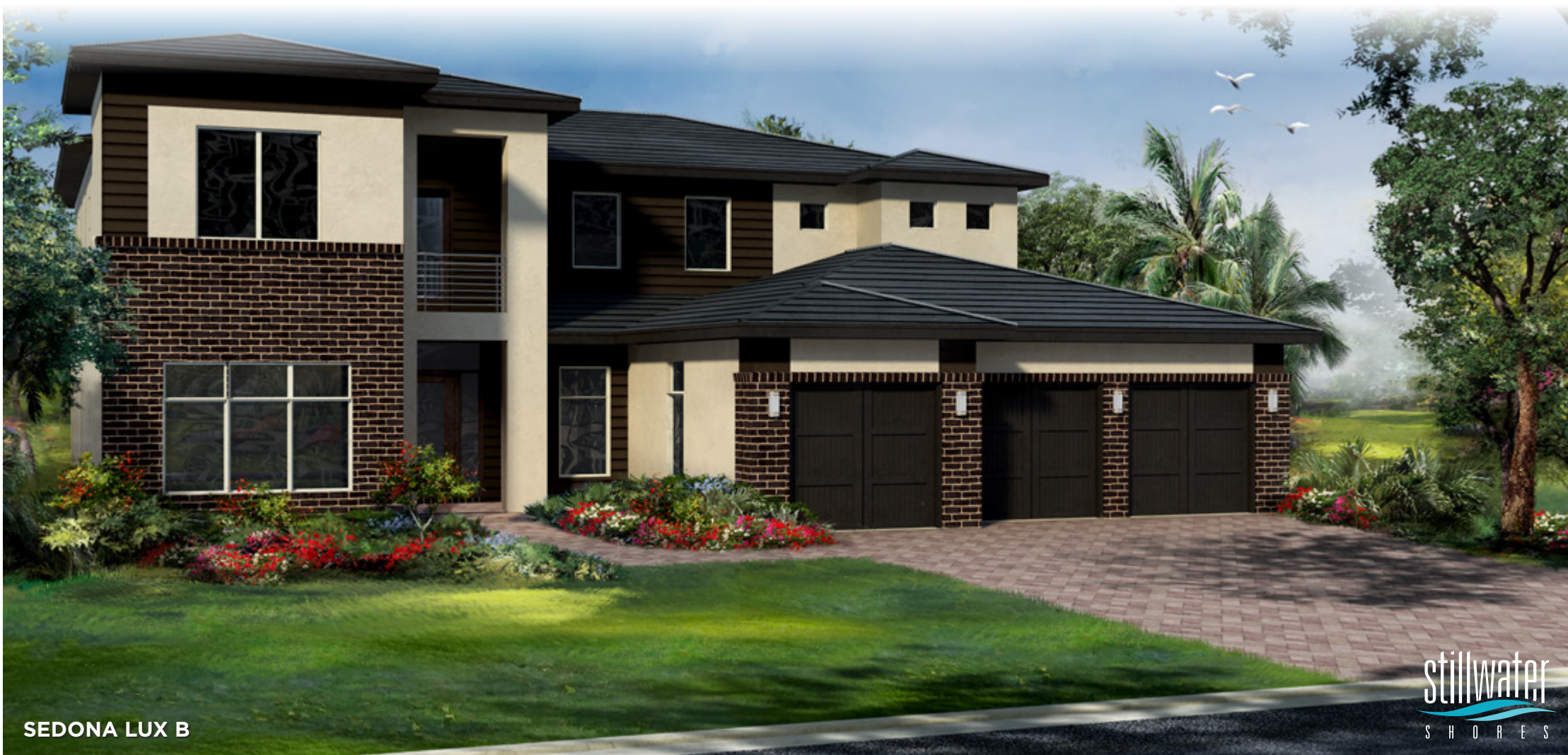
SEDONA LUX B