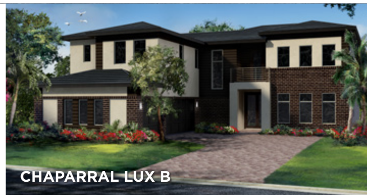
CHAPARRAL LUX B