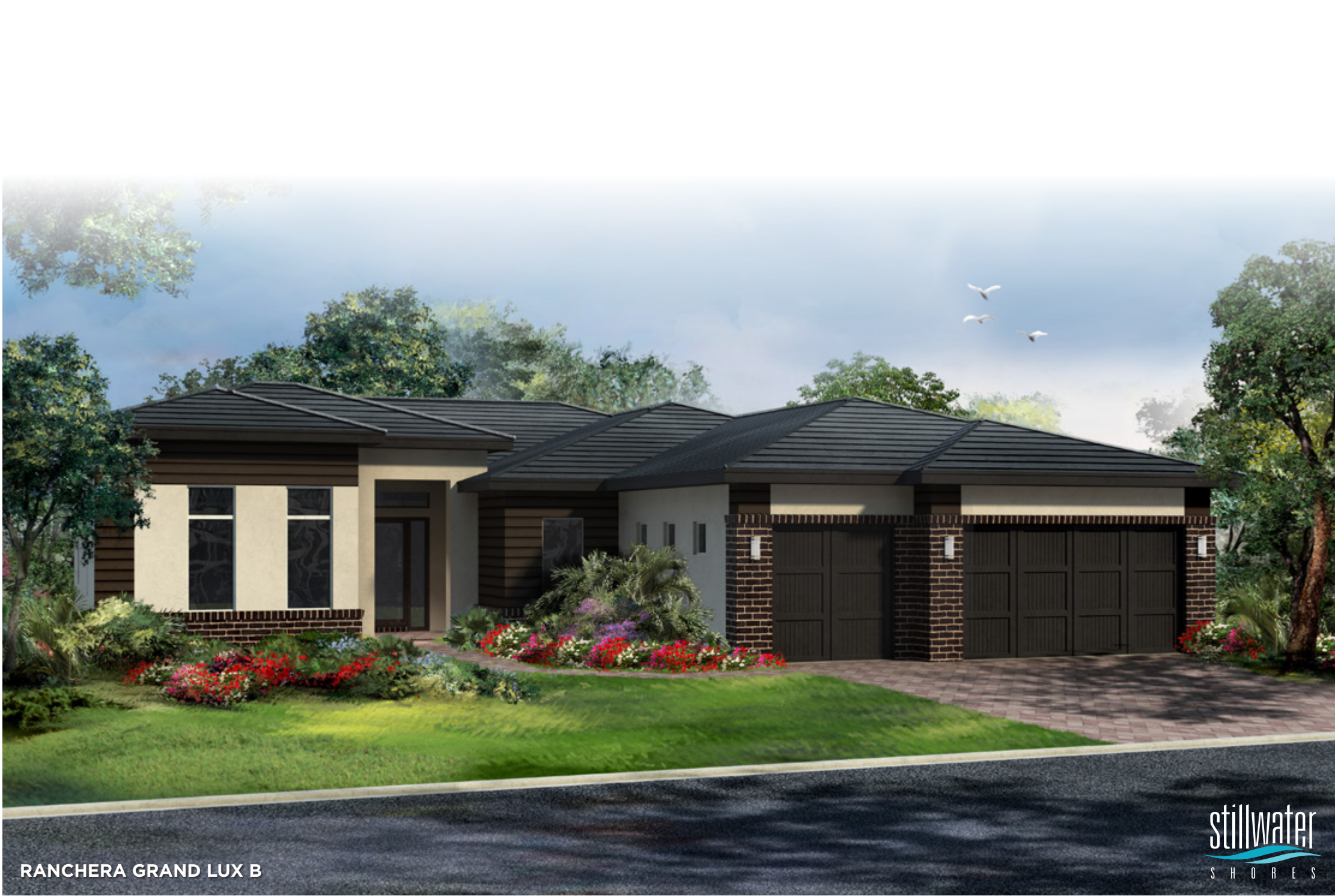
RANCHERA GRAND LUX B