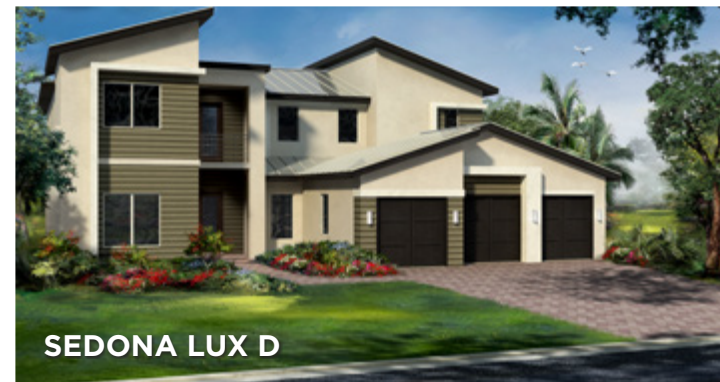
SEDONA LUX D