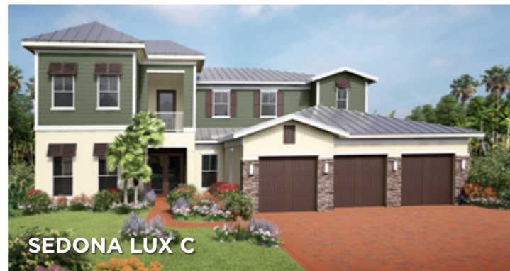
SEDONA LUX C